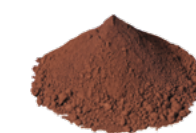
D: Dark Brown