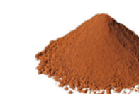
L: Light Brown