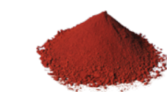
A: Brick Red