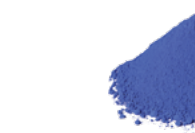
N: Aegean Blue

Note that actual colors may vary from on-screen representation. Please view physical color samples or perform a test application to confirm your color choices.