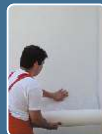
In cases of multiple cracks, the first layer of FLEXCOAT is reinforced, while it is still fresh, with the polyester fabric ( TREVIRA , 100 cm width).