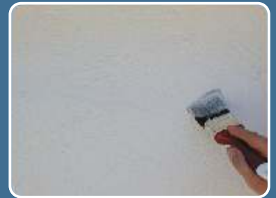
After ISOMASTIC-A has dried, the crack is painted with FLEXCOAT along its length.