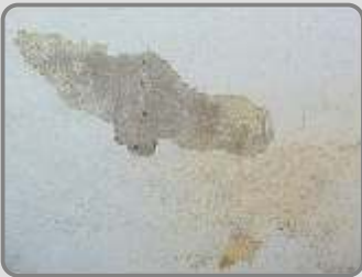
Crumbling plasters are a common phenomenon for walls with moisture problems.