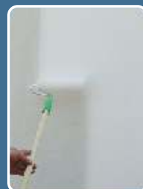
After drying, the surface is painted with a layer of FLEXCOAT .