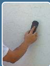
Substrate should be thoroughly cleaned from dust etc.