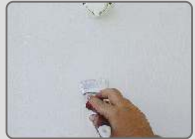
The 2 nd layer of FLEXCOAT is applied after the first one has completely dried.