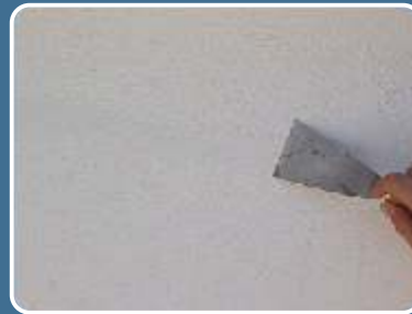
While the sealant is fresh it is formed with a spatula.