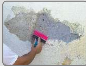
The surface is primed with FLEX-PRIMER and the surface is stabilized.