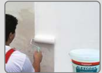
Finally, the surface is painted with two layers of FLEXCOAT .