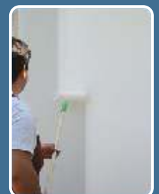
Two more layers of FLEXCOAT should be applied in order to cover the polyester fabric ( TREVIRA ). Without using TREVIRA one layer of FLEXCOAT is enough.