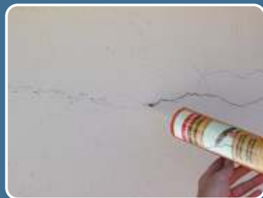
The crack is sealed with elastoplastic acrylic sealant ISOMASTIC-A .