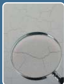
Extended cracks to plaster out of being an aesthetical problem, may sometimes also be dangerous for the plasters durability against water and freeze.