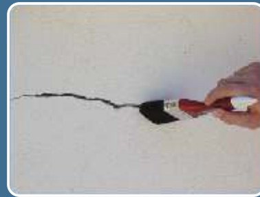
Crack should be thoroughly cleaned from dust.