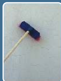
The surface is primed with FLEX-PRIMER . Especially when the plaster is crumbling, FLEX-PRIMER stabilizes it.