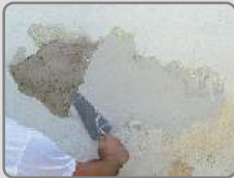
The plaster is fixed with the repairing mortar UNICRET-FAST , improved with the resin ADIPLAST .