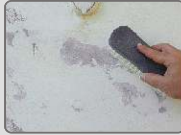
Substrate should be thoroughly cleaned from dust etc.