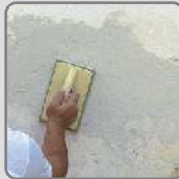
After the plaster has been sufficiently set it is smoothed by hand with a spongy float.