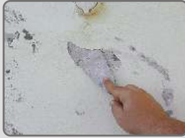
Old colour should be scratched with a spatula and the loose particles should be removed.