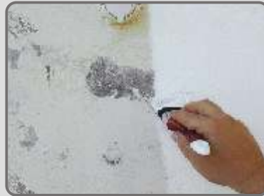
After drying, the surface is painted with two layers of FLEXCOAT .