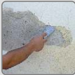
The crumbling particles are removed with a spatula and the surface is thoroughly cleaned from dust.