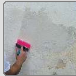
As soon as the plaster has dried, the surface is primed again with FLEX-PRIMER .