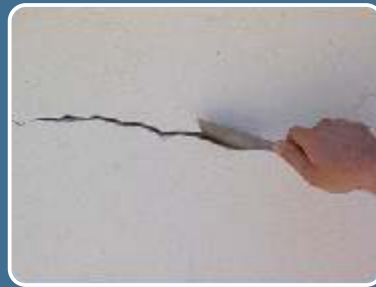
Wherever it is required, the crack is opened with a spatula in a width of 3mm.