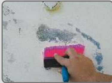
The surface is primed with FLEX-PRIMER .