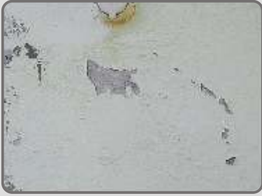
Damaged colour is the first indication that the plaster is corrupted from water.